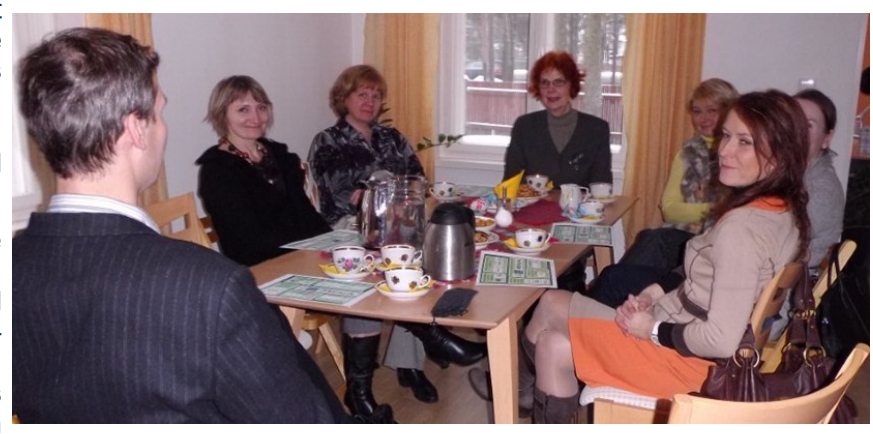
Training workshop in Estonia, January, 2013

tool itself and how to implement it in their daily routine. They were accredited by the European Alliance against Depression and by national or regional professional organisations. Professionals were thereby equipped to recruit patients to the study and to the internet has become everyday guide patients as they progressed with the tool. To date, 87 patients have