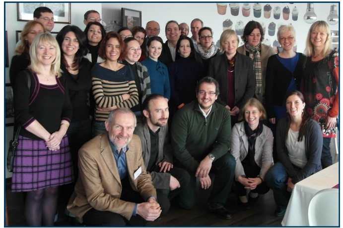
The PREDI-NU consortium at the 4th project meeting in Colares, Portugal

The iFightDepression tool and website represent concrete resources that will continuously contribute to the promotion of health and distribution of health knowledge. They will also continue to be implemented in the European regions that were involved in Predi-Nu, and will be further developed by the European Alliance against Depression (a non-profit organisation dedicated to the improvement of depression care and prevention of suicidal behaviour).