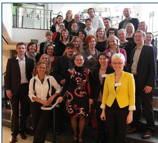
The PREDI-NU project group at the final project meeting in Brussels, Belgium, April 2014