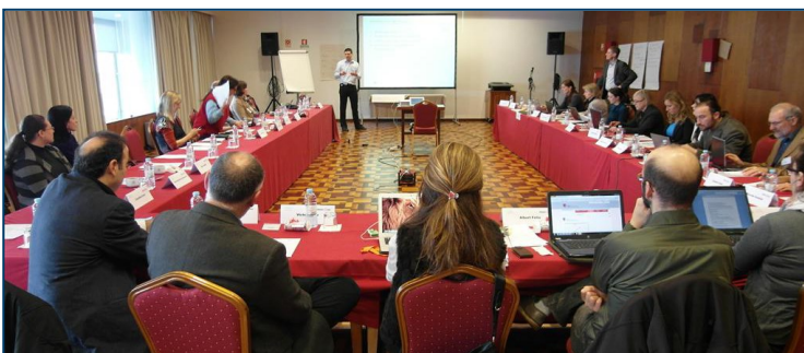
The PREDI-NU project group at a project meeting in Colares, Portugal

Approximately 200 patients and 160 healthcare professionals from regions in Hungary, Estonia, Ireland, Spain and Germany were involved in evaluating the acceptability of the iFightDepression tool and the feasibility of its use. Results and feedback demonstrated the value of the tool and its many benefits as an additional resource for improving the care of individuals with depression: