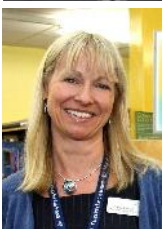
The members of the Scientific Advisory Board