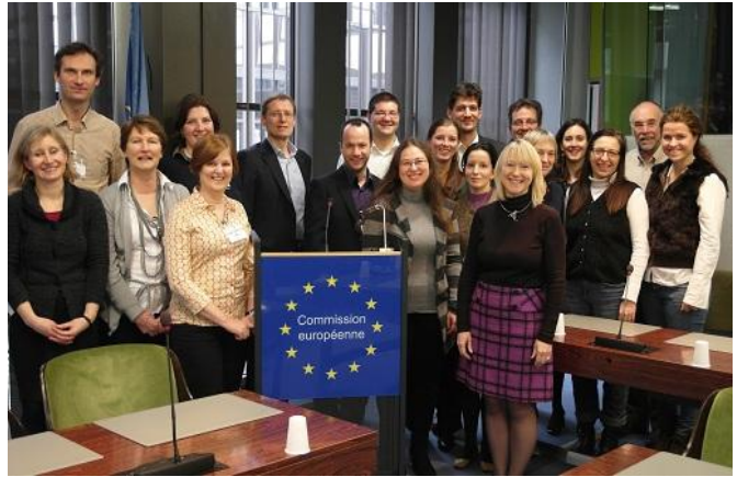
The PREDI-NU consortium during the 2nd project meeting at the European Commission in Luxembourg, February 2012